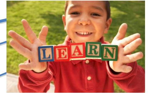
A Ready & Successful State supports children's learning and development